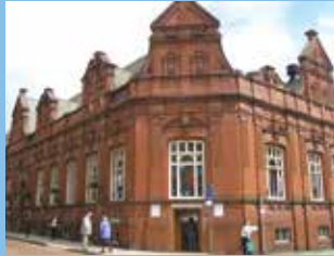
Crown Street Library Crown Street, Darlington, DL1 1ND