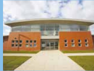
Coleridge Centre Coleridge Gardens, Darlington, DL1 5AJ