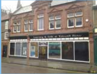
Tubwell Row The Old Museum, Tubwell Row, Darlington, DL1 1PD